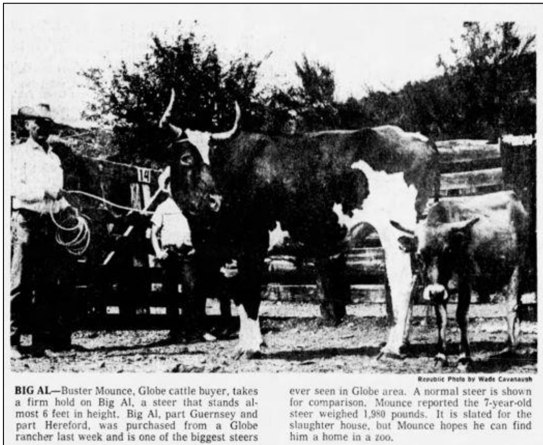
Figure 6. Buster Mounce and “Big Al” pose for the camera, ca. 1962.