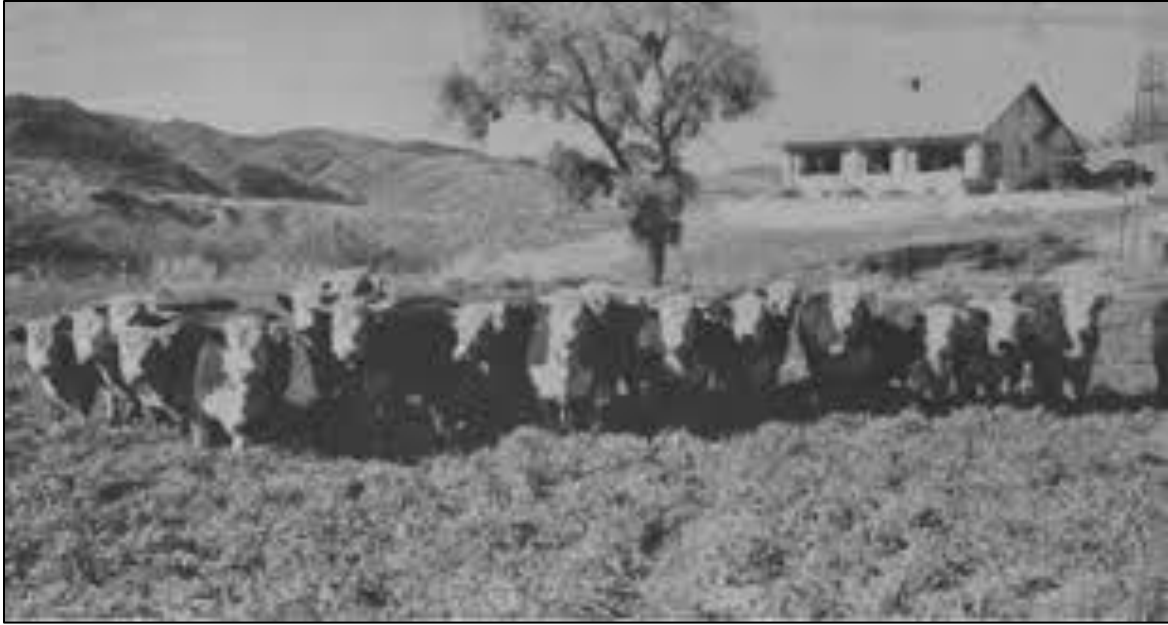
Figure 1. A group of Herefords gather at the Bixby Ranch (from Progressive Agriculture , July-August 1964).