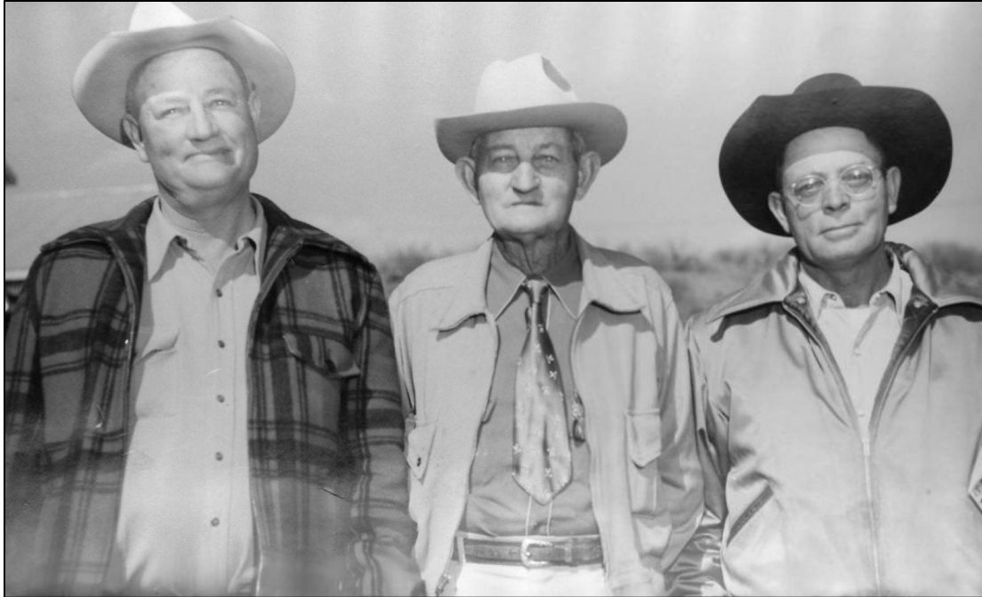
Figure 5. W.E., L.W., and P.F. Bohme, ca. 1950s.