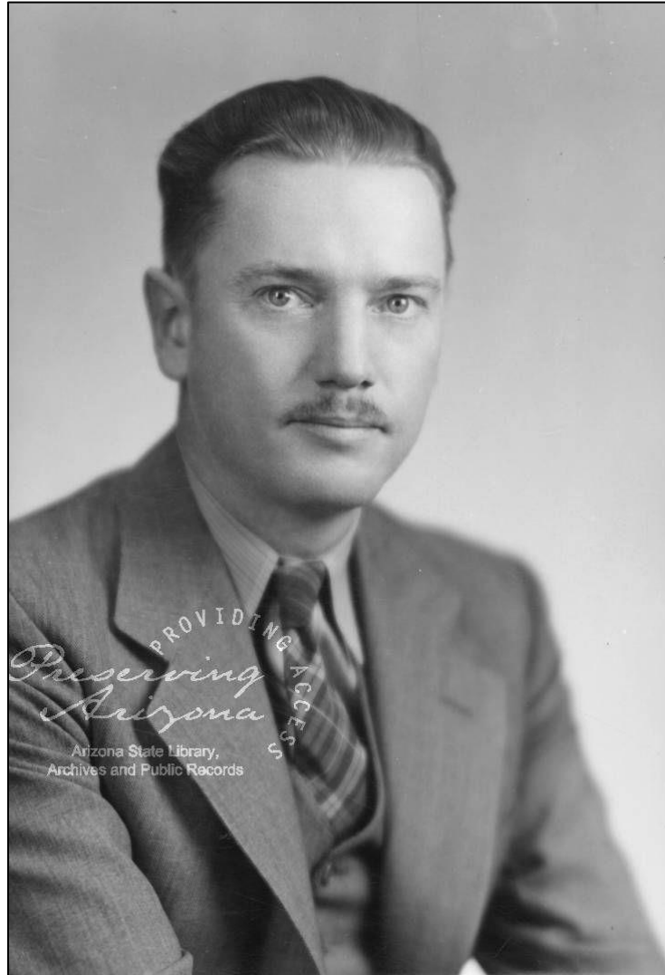
Figure 3. S.L. Bixby, Arizona State Senator and rancher, ca. 1941 (from AZ State Library, Archives and Public Records).

1928. In 1940, after running a successful cattle operation for over a decade and serving as president of the Gila County Farm Bureau, Stephen Bixby was elected state senator, and held the position from 1941 to 1948 (Figure 3).